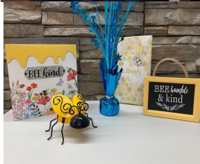
Blue Earth County