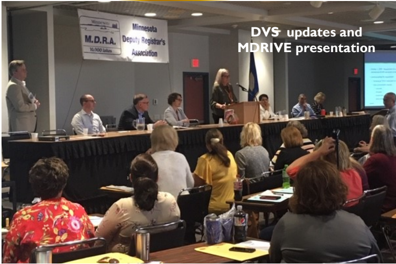
DVS updates and MDRIVE presentation