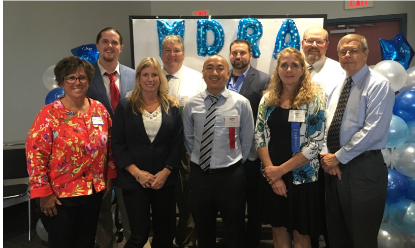
Introducing your 2019-2020 Board of Directors