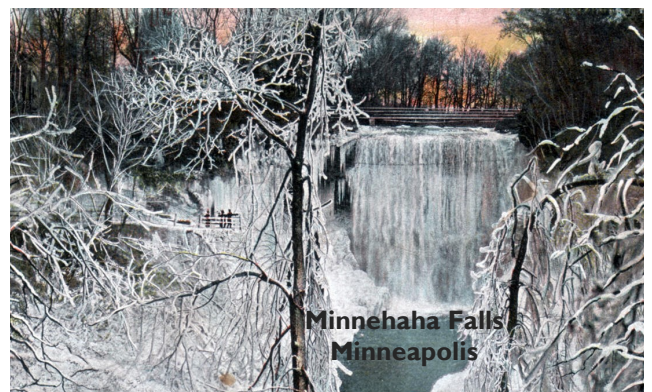
Minnehaha Falls Minneapolis